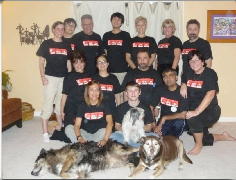
International school safety research team - 2008