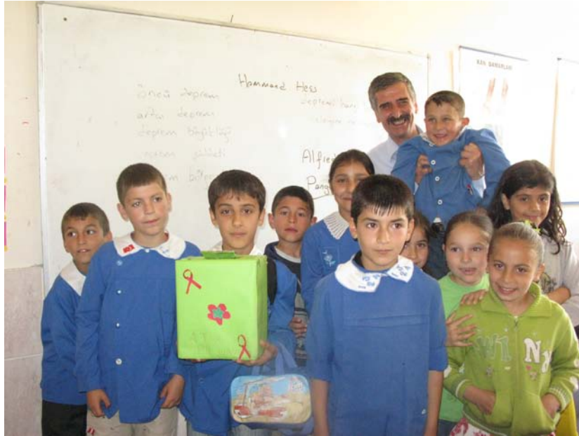
Ibni Sina IOO, Istanbul, 2009