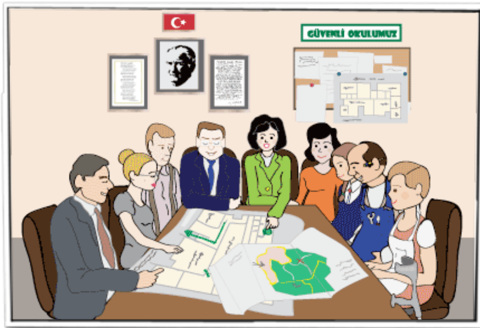
School Disaster and Emergency Management Committee

The DREAMS for Turkey project is made possible by the generous grant from American Red Cross. that runs through 2011.